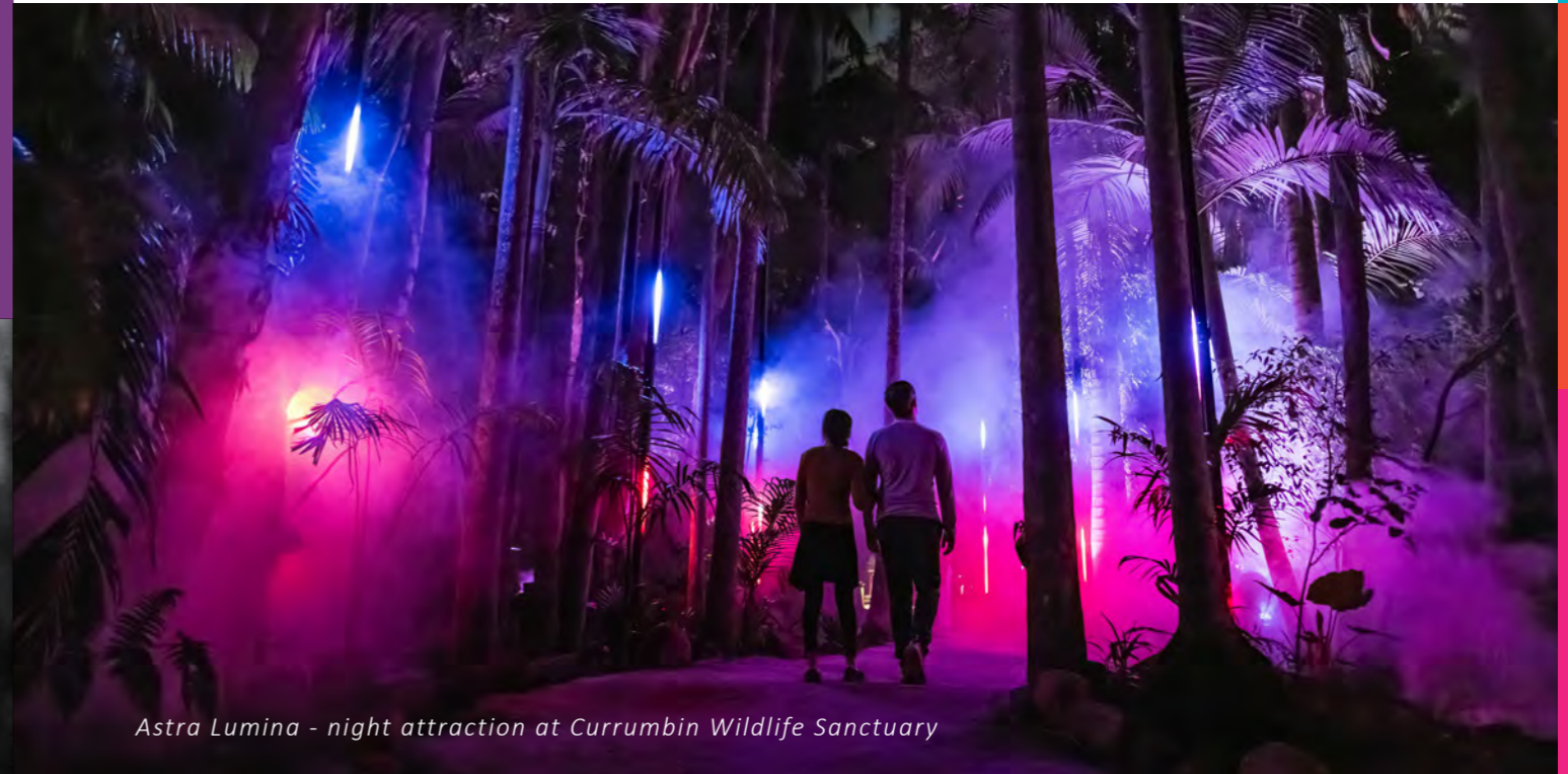
Astra Lumina - night attraction at Currumbin Wildlife Sanctuary

The National Trust of Australia (Queensland) Board of Directors meet annually with the Senior Leadership team to review the organisational strategies under each Strategic Priority. This guides the direction and the activities for the year ahead. The National Trust Board is committed to having relevant and effective strategic goals to ensure its mission to conserve and advance natural and cultural heritage for future generations is fulfilled.