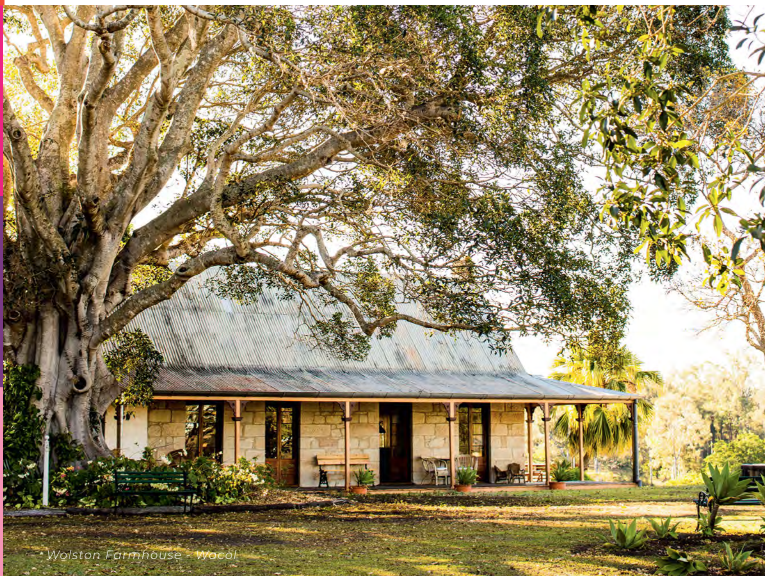
Wolston Farmhouse - Wacol