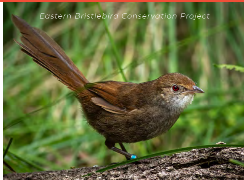
Eastern Bristlebird Conservation Project

To be leaders in Conservation and Heritage..