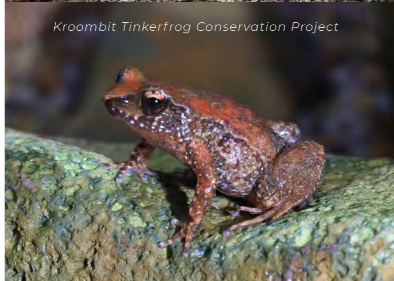
Kroombit Tinkerfrog Conservation Project