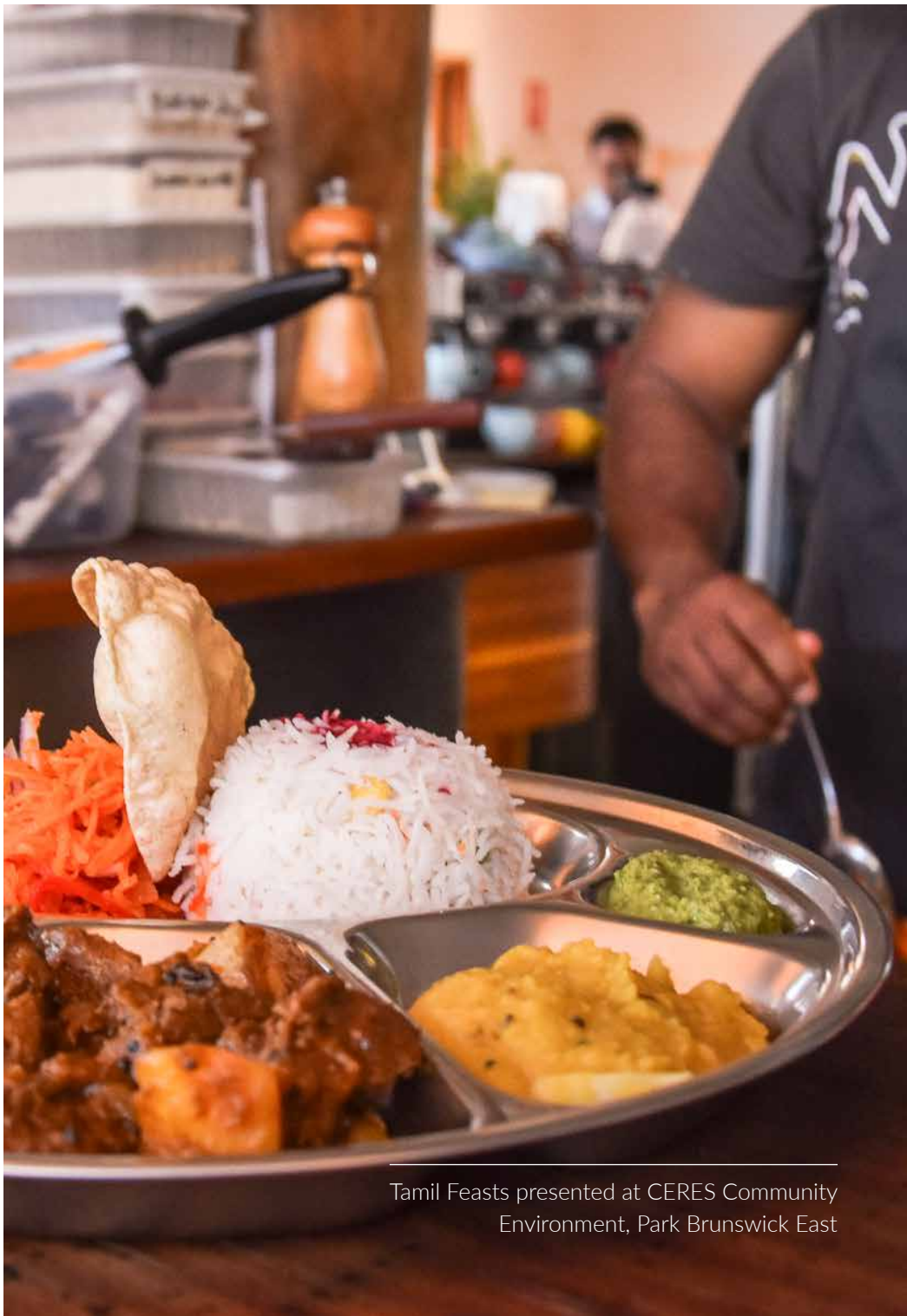
Tamil Feasts presented at CERES Community Environment, Park Brunswick East