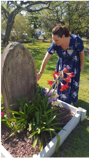
The Adopt-A- Grave program saving history and giving respect to all.